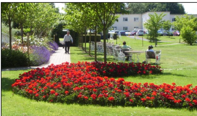
OAKLANDS LODGE - free accommodation for patients and families set in the 18 acre gardens